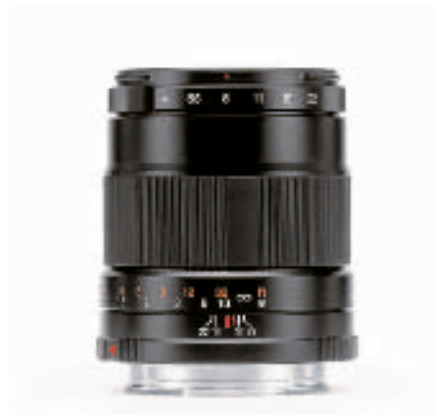
HASSELBLAD 4/90 MM 3024019

The dedicated 49 mm center filter is recommended for critical situations where transparency film is used. The center filter is normally not required when using negative film if the lens is stopped down to f/8 or smaller aperture.