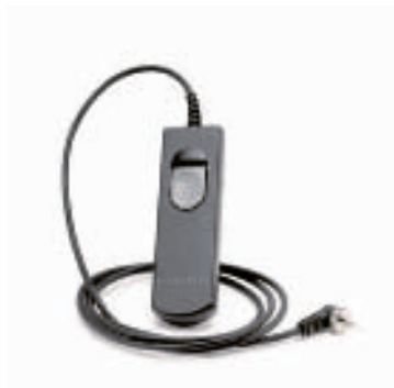
RELEASE CORD XPan II 3054510

The Center Filter XPan ensures the highest corner-to-corner illumination by neutralizing the natural effect of light fall-off that may be apparent in critical applications on transparency film in the panorama format at large aperture settings.